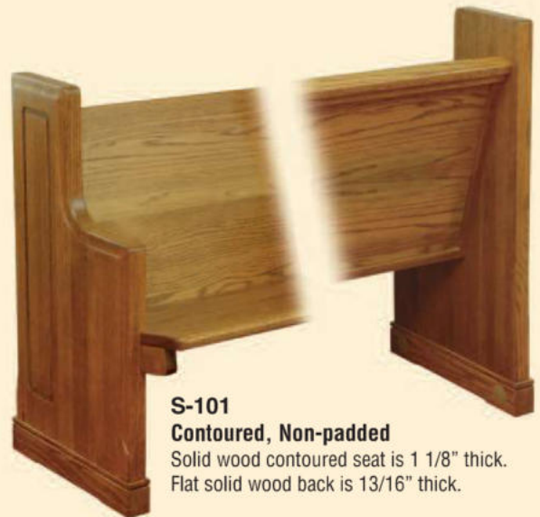
S-101 Contoured, Non-padded Solid wood contoured seat is 1 1/8" thick. Flat solid wood back is 13/16" thick.