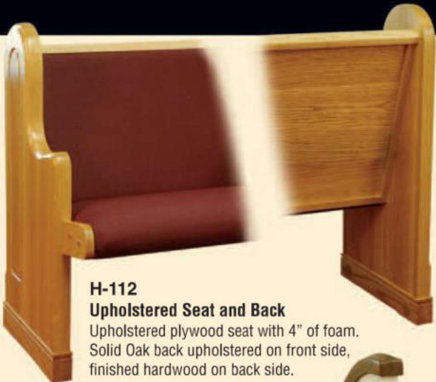
H-112 Upholstered Seat and Back Upholstered plywood seat with 4" of foam. Solid Oak back upholstered on front side, finished hardwood on back side.

Several different pew body styles are available. A wide variety of fabrics and colors complete your selection process. A spring seat and a lumbar support back are available on request for the ultimate in comfort.