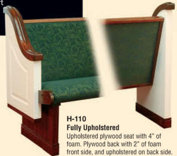
H-110 Fully Upholstered Upholstered plywood seat with 4" of foam. Plywood back with 2" of foam front side, and upholstered on back side.