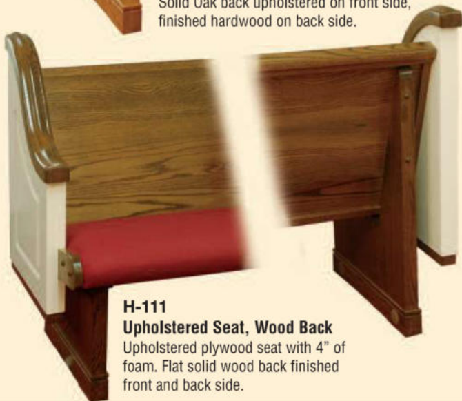
H-111 Upholstered Seat, Wood Back Upholstered plywood seat with 4" of foam. Flat solid wood back finished front and back side.