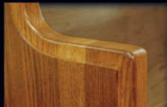
Wide Shape Cut