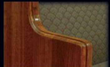
Double Bead Cut