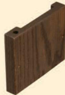
Card & Pencil Holders